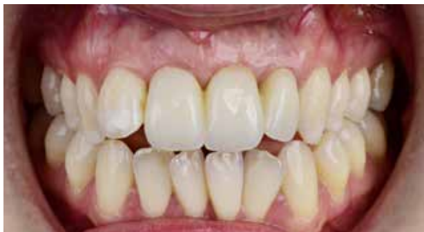
Fig. 2. A monolithic (full contour), high translucent, multi-shaded, implant-supported zirconia dental reconstruction 11 21 22.