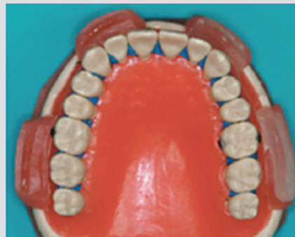
Fig. 1. Dentoform model (Columbia Dentoform, Long Island City, N.Y.) with embedded ball bearings and stops made of Triad Denture Base Material (Dentsply Trubyte, York, Pa.), which allowed the tray to be seated in a reproducible manner.